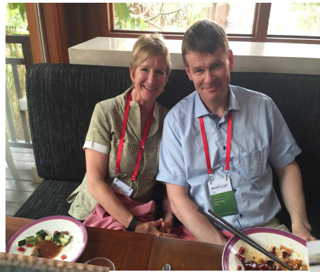
MegaFlorestais Brazil, 2008

And last, but not least: Foster strong relationships and empower forest leaders to become change agents within their agencies and across ministries.